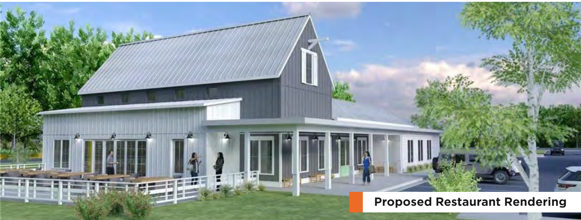
Proposed Restaurant Rendering

Surrounded by rapid residential growth, major employers, and destination drivers such as Château Élan Winery & Resort and Road Atlanta, the Property is well-positioned to serve both local and regional demand. Flexible build-to-suit options allow users to capitalize on continued growth in Northeast Metro Atlanta.