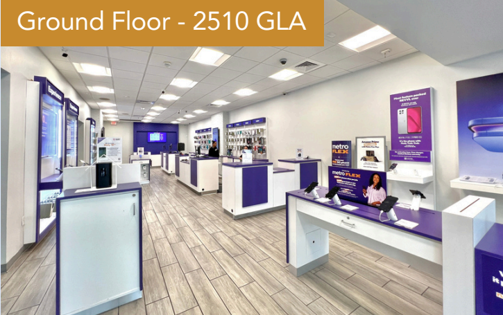
Ground Floor - 2510 GLA