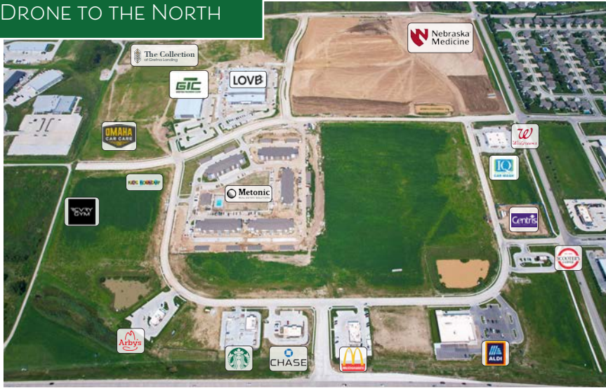
DRONE TO THE NORTH