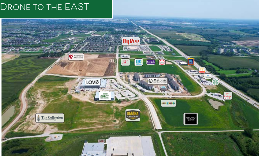
DRONE TO THE EAST