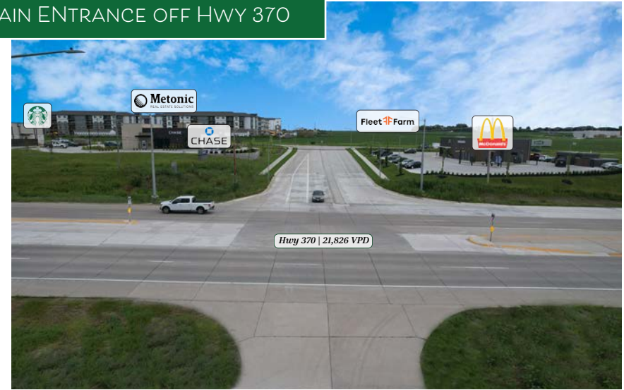
MAIN ENTRANCE OFF HWY 370