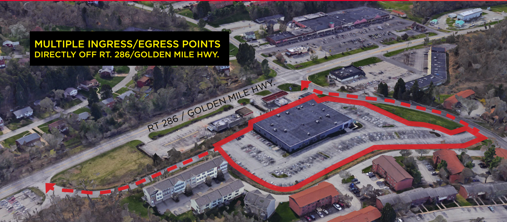
SINGLE TENANT USER LAYOUT

MULTIPLE INGRESS/EGRESS POINTS DIRECTLY OFF RT. 286/GOLDEN MILE HWY.