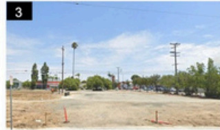
5822-5941 Linden Ave Long Beach, CA