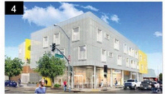
1814 Pine Ave Long Beach, CA