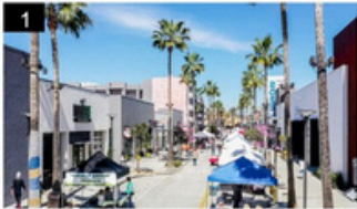
200-290 E 4th St Long Beach, CA