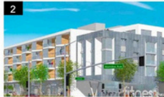
300 Alamitos Long Beach, CA