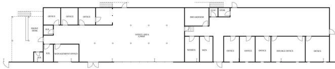
OFFICE INSET SCALE: 1/8"=1'-0"