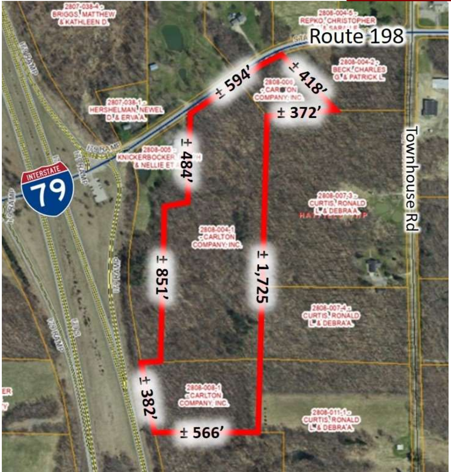
382' Frontage Along I-79 at Exit 154 (Saegertown, PA)

For Sale | Route 198 at I-79 | Saegertown, PA 16433