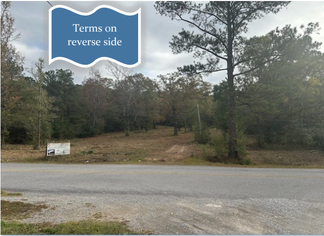
Underbrush recently cleared at site