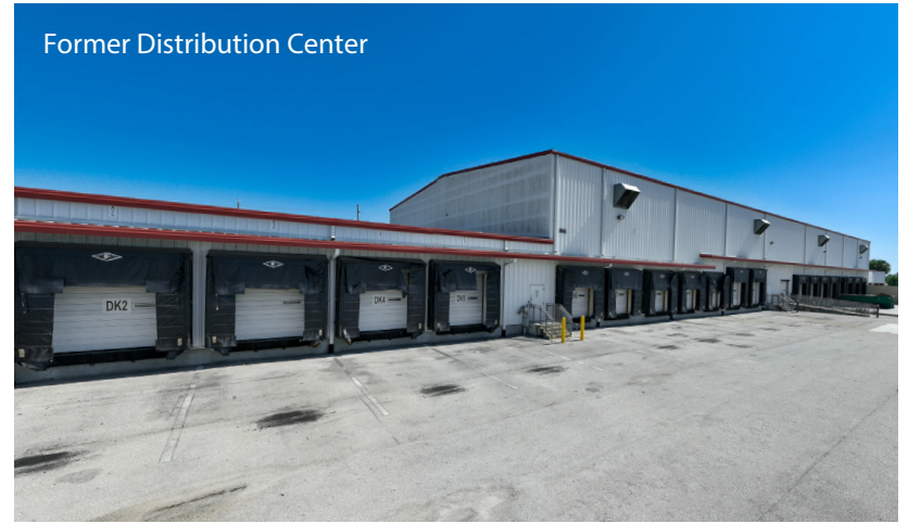
Former Distribution Center