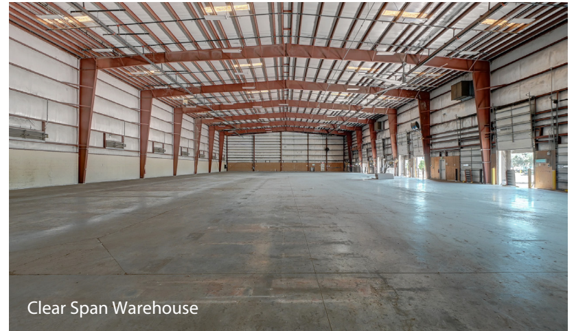
Clear Span Warehouse