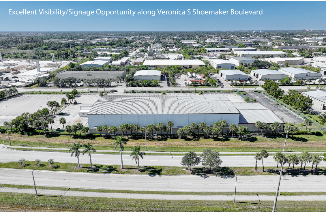
Excellent Visibility/Signage Opportunity along Veronica S Shoemaker Boulevard