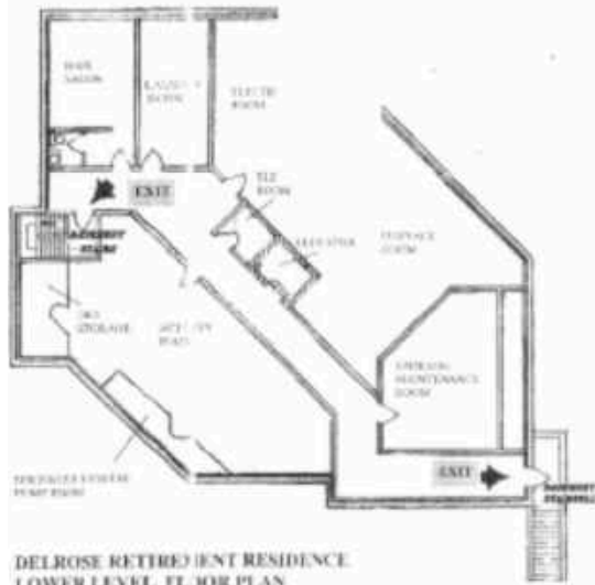
DELROSE RETIREMENT RESIDENCE LOWER LEVEL FLOOR PLAN