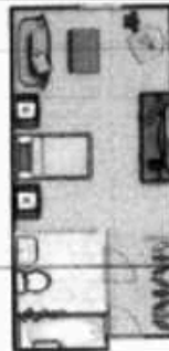
Suite A (298 sq. ft.)