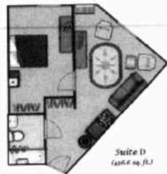
Suite D (406.6 sq. ft.)