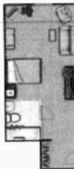
Suite B (344.2 sq. ft.)