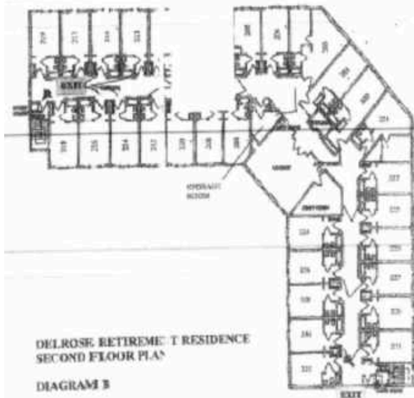
DELROSE RETIREMENT RESIDENCE SECOND FLOOR PLAN