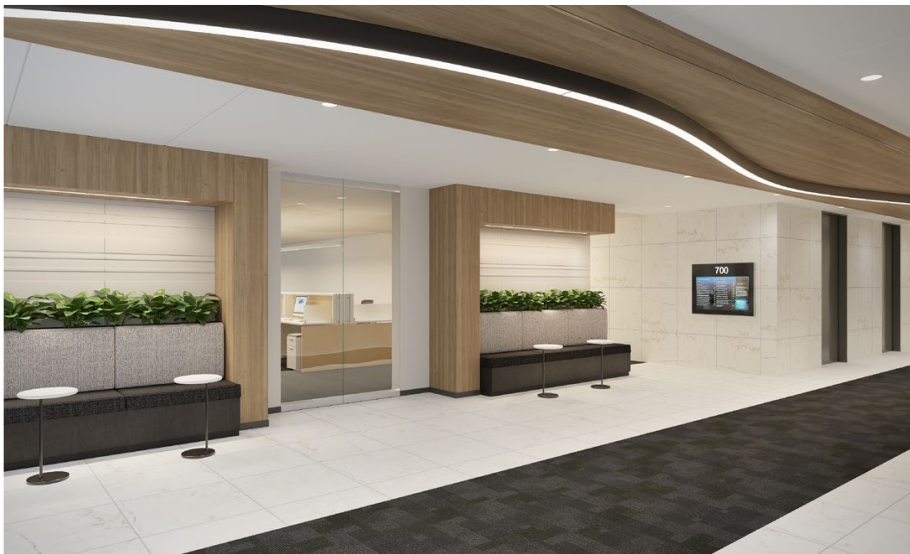
MAIN LOBBY, ELEVATOR LOBBIES & RESTROOMS