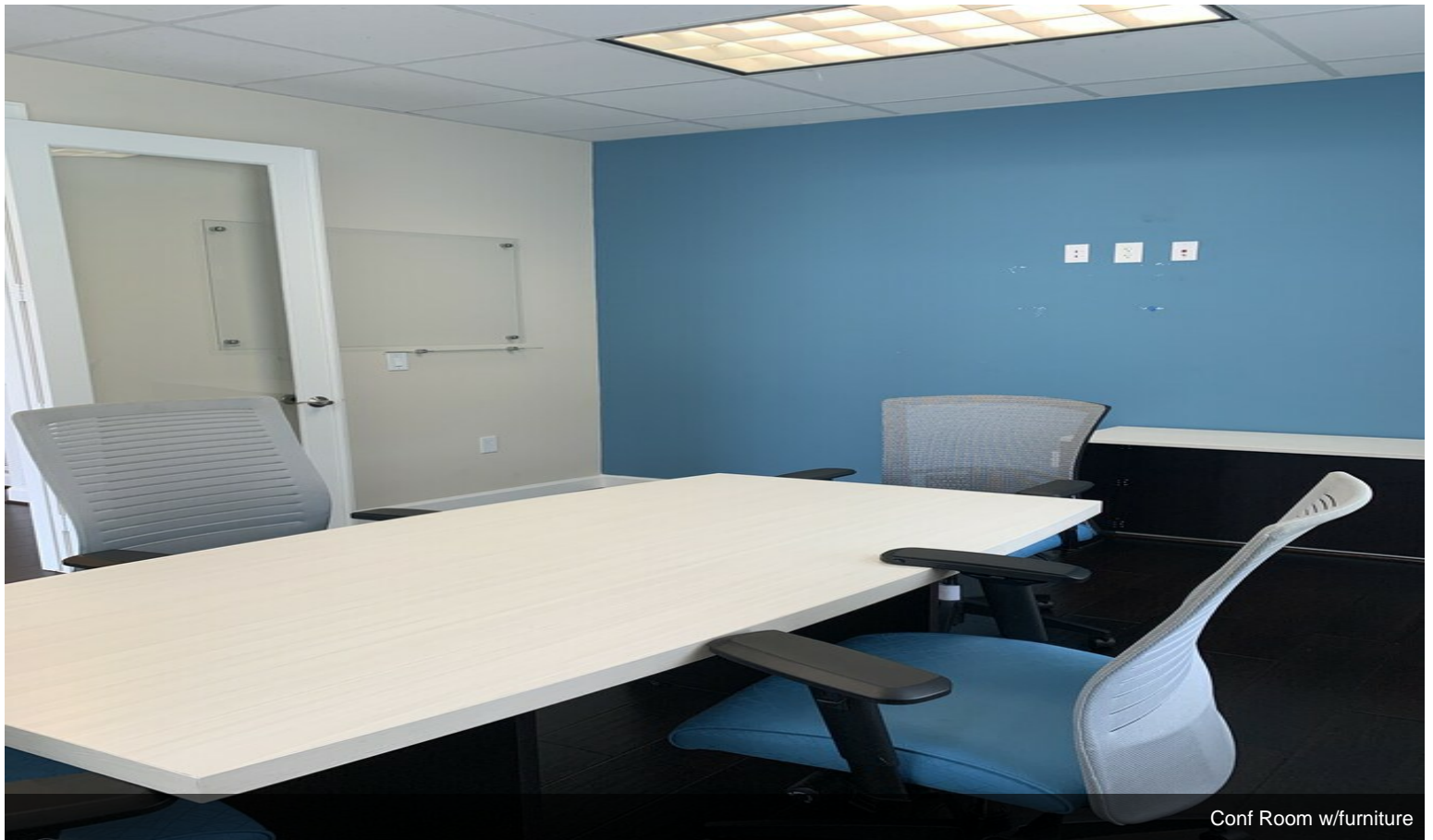
Conf Room w/furniture