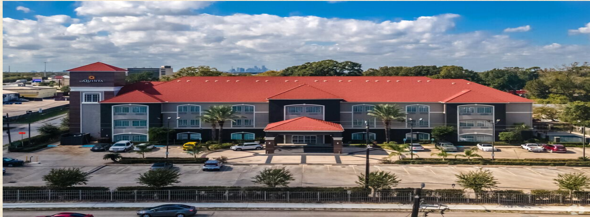
La Quinta Inn & Suites by Wyndham Houston East at Normandy 930 Normandy Street, Houston, Texas 77015