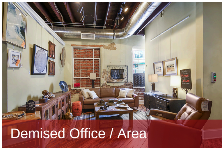
Demised Office / Area