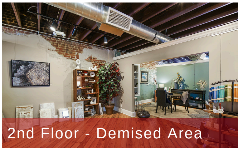
2nd Floor - Demised Area

KW COMMERCIAL G2 Real Estate Group 8555 N River Road, Ste. 200 Indianapolis, IN 46240