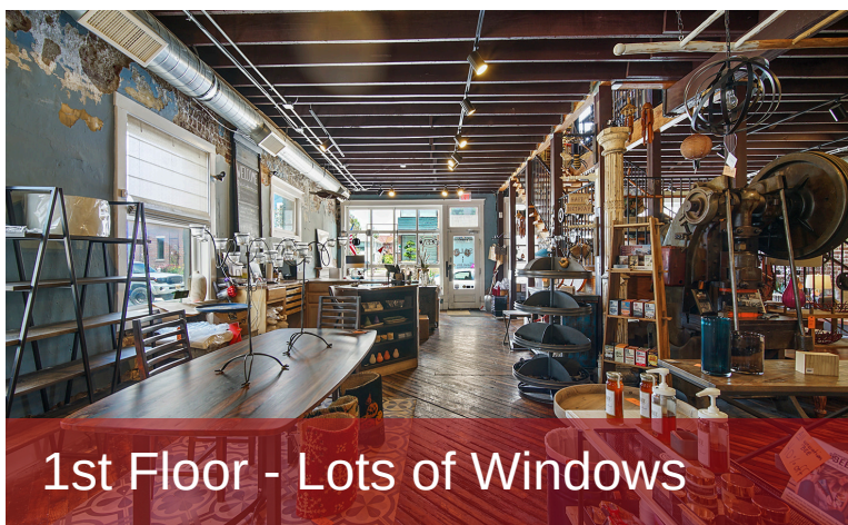
1st Floor - Lots of Windows