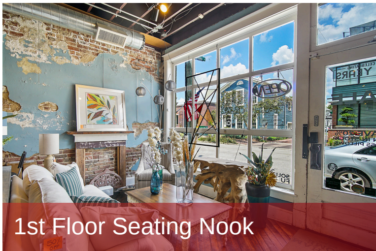
1st Floor Seating Nook