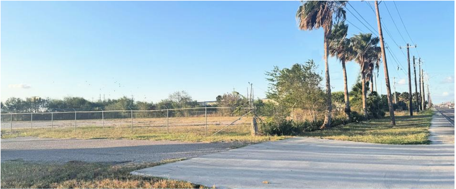
VACANT PLATTED LAND ON THE SOUTHSIDE, NEAR CROSTOWN EXPRESSWAY