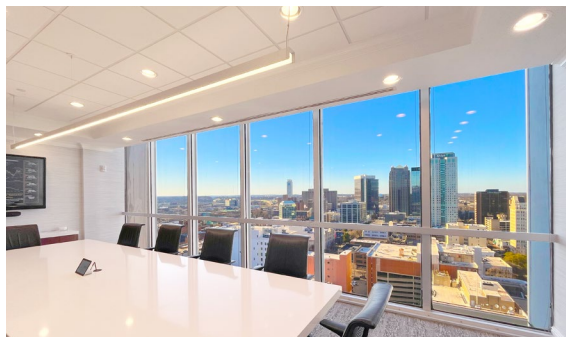
Unparalleled Scenic Views of UAB and CBD