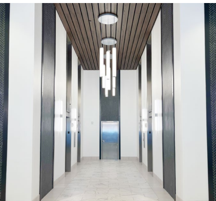
Fully Renovated Lobby