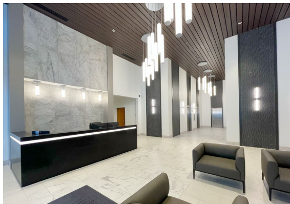
Fully Renovated Lobby