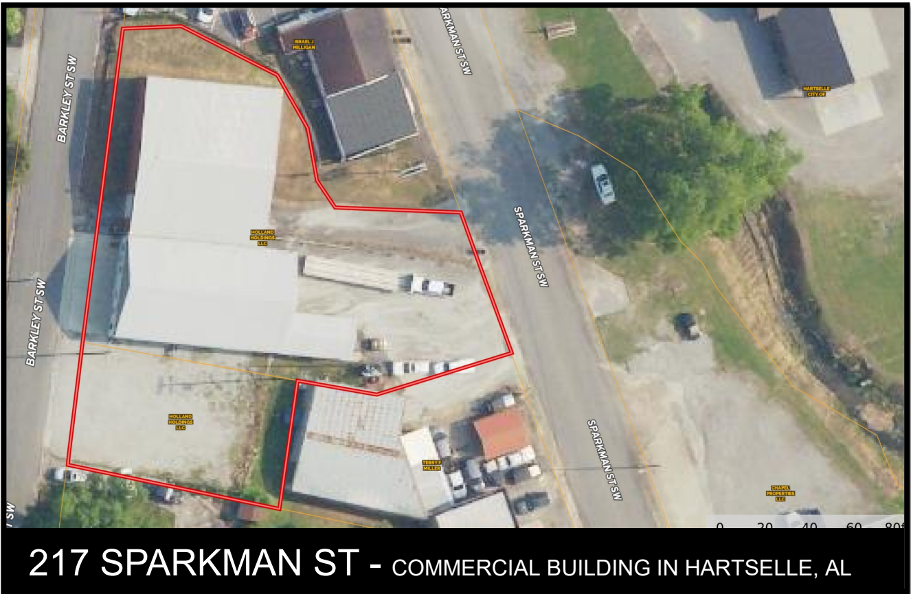
217 SPARKMAN ST - COMMERCIAL BUILDING IN HARTSELLE, AL