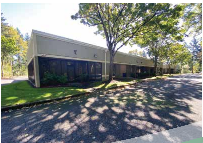
Although we obtained the information above from sources we believe to be reliable, we make no guarantee about its accuracy. It is submitted subject to the possibility of errors, omissions, change of price, rental or other conditions, prior sale, lease or financing, or withdrawal without notice. You and your legal advisors should conduct your own investigation of the property before transaction.