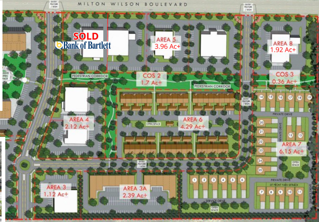
*conceptual site plan