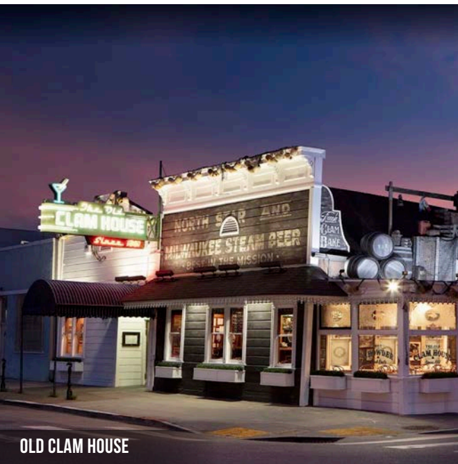
OLD CLAM HOUSE