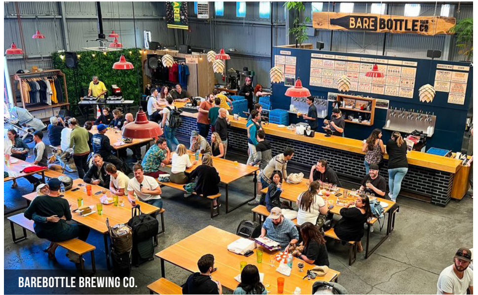
BAREBOTTLE BREWING CO.