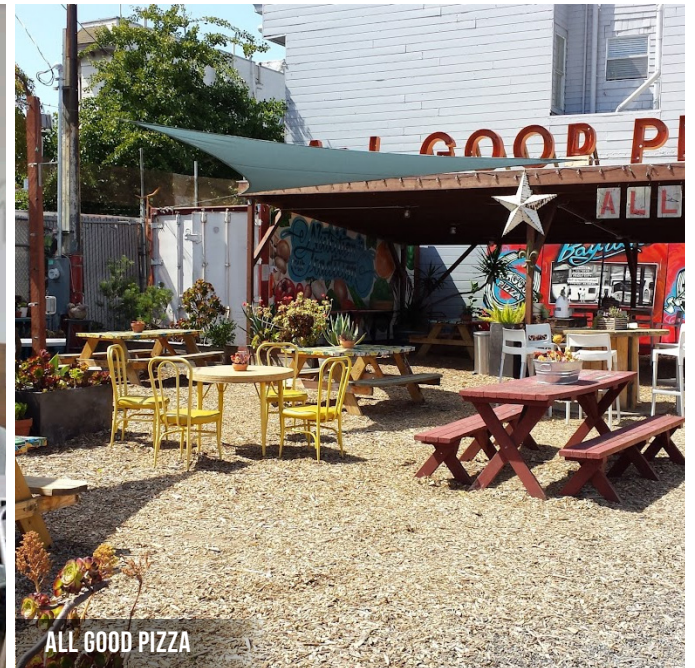
ALL GOOD PIZZA