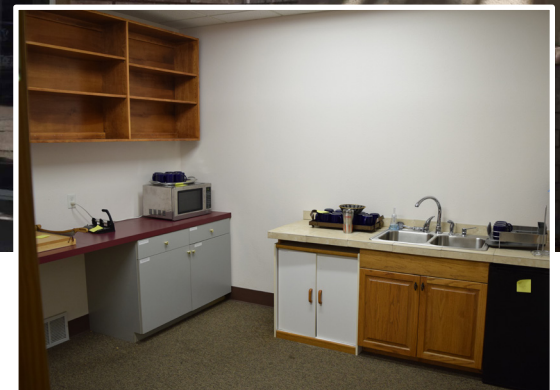
Break Room with Kitchenette