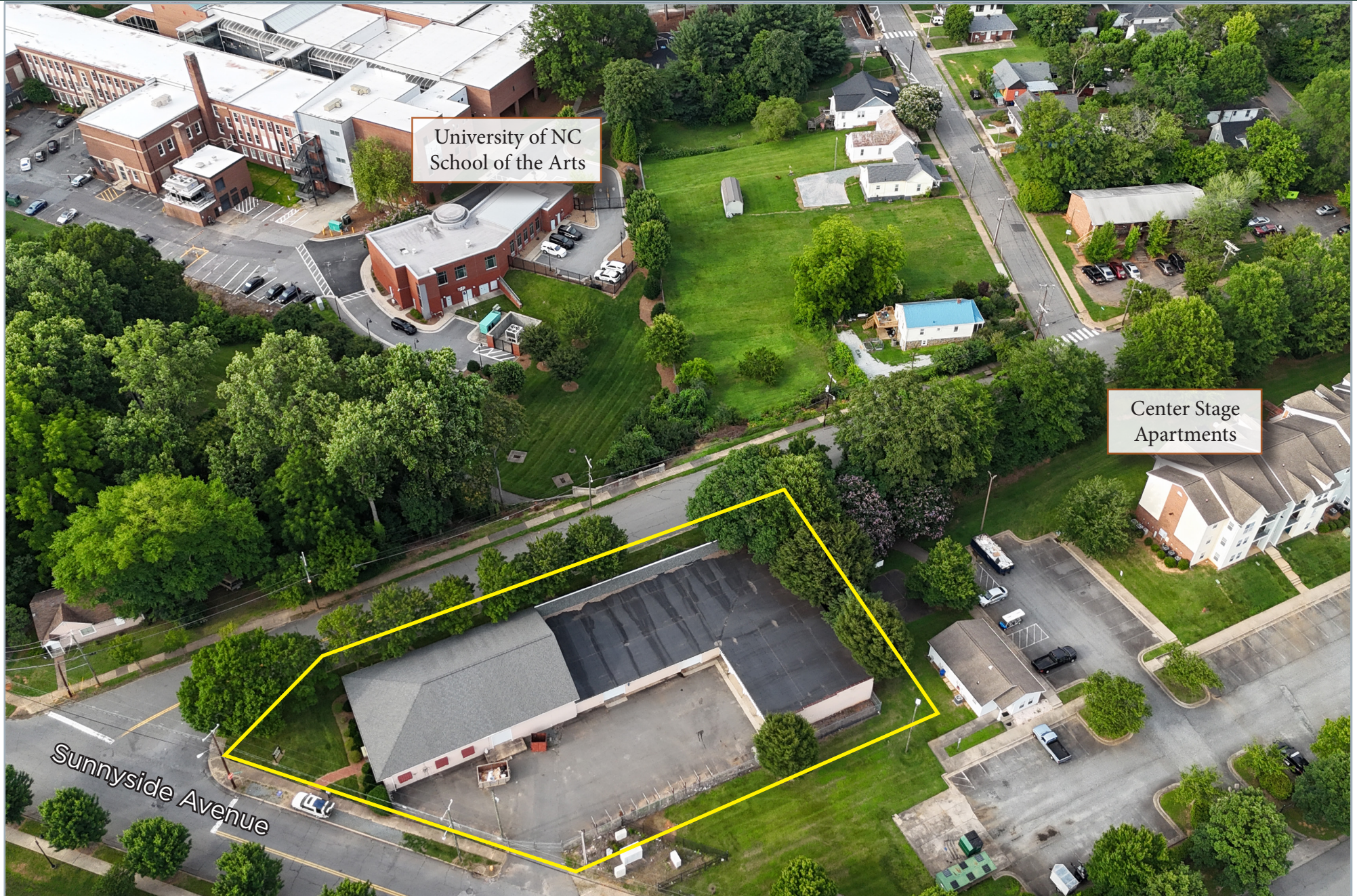
University of NC School of the Arts