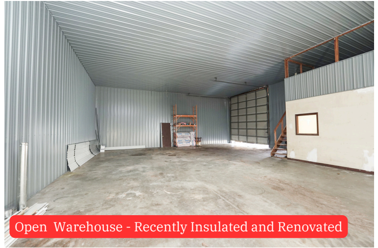
Open Warehouse - Recently Insulated and Renovated