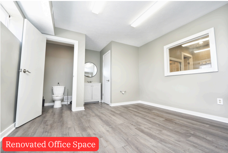
Renovated Office Space