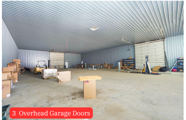
3 Overhead Garage Doors