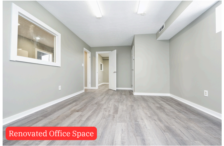
Renovated Office Space