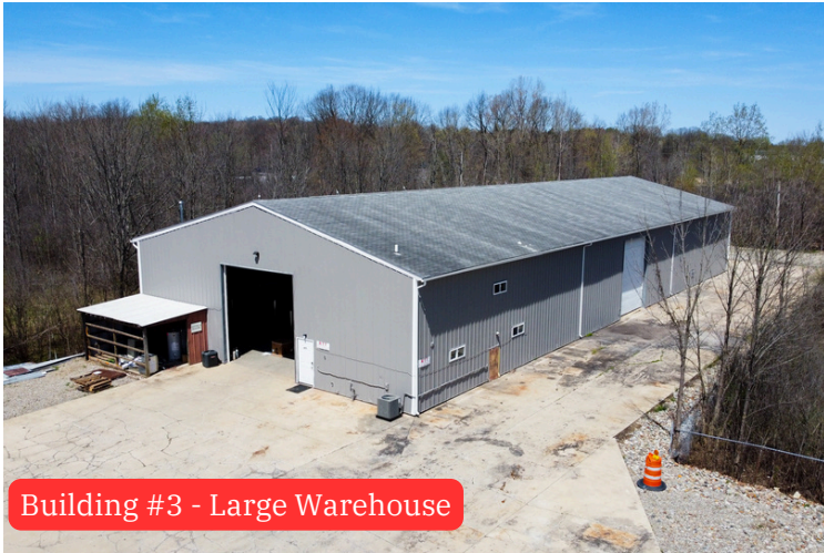
Building #3 - Large Warehouse