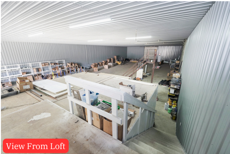
View From Loft