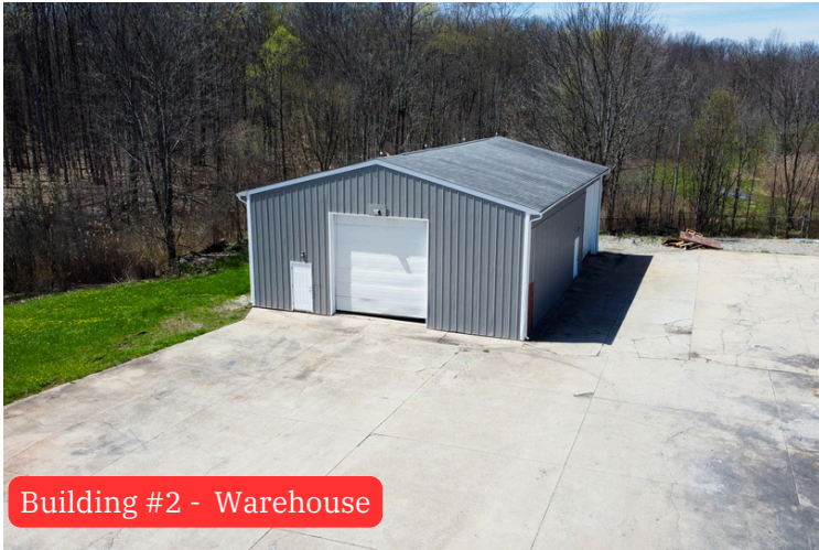
Building #2 - Warehouse