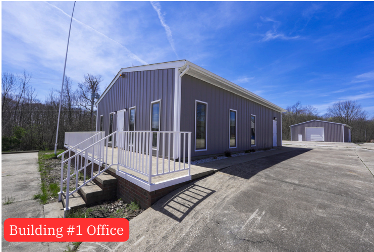
Building #1 Office