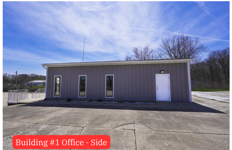
Building #1 Office - Side