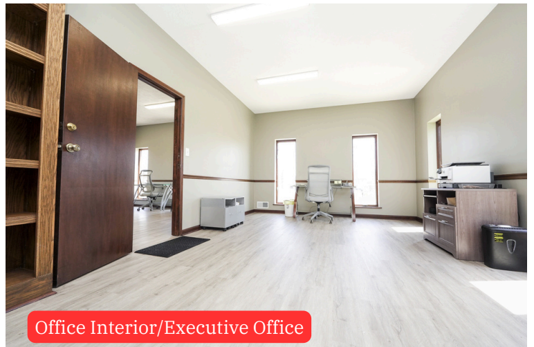
Office Interior/Executive Office