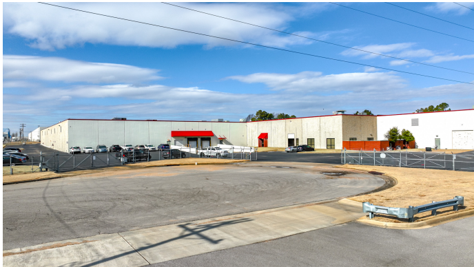
Cypress Woods Lane Entrance