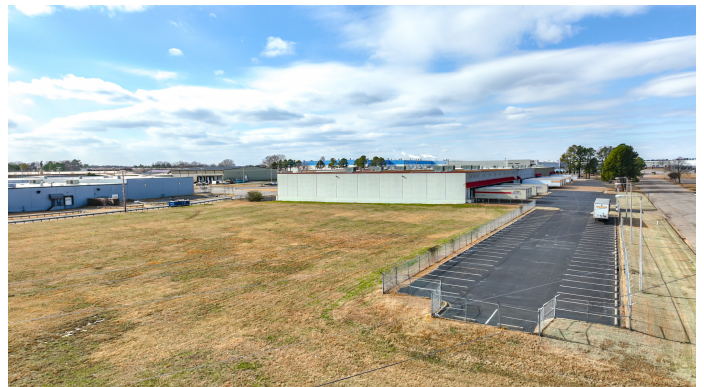
Vacant lot at Deerfield and Wildwood Drive