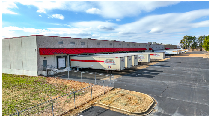
Wildwood Drive Truck Court