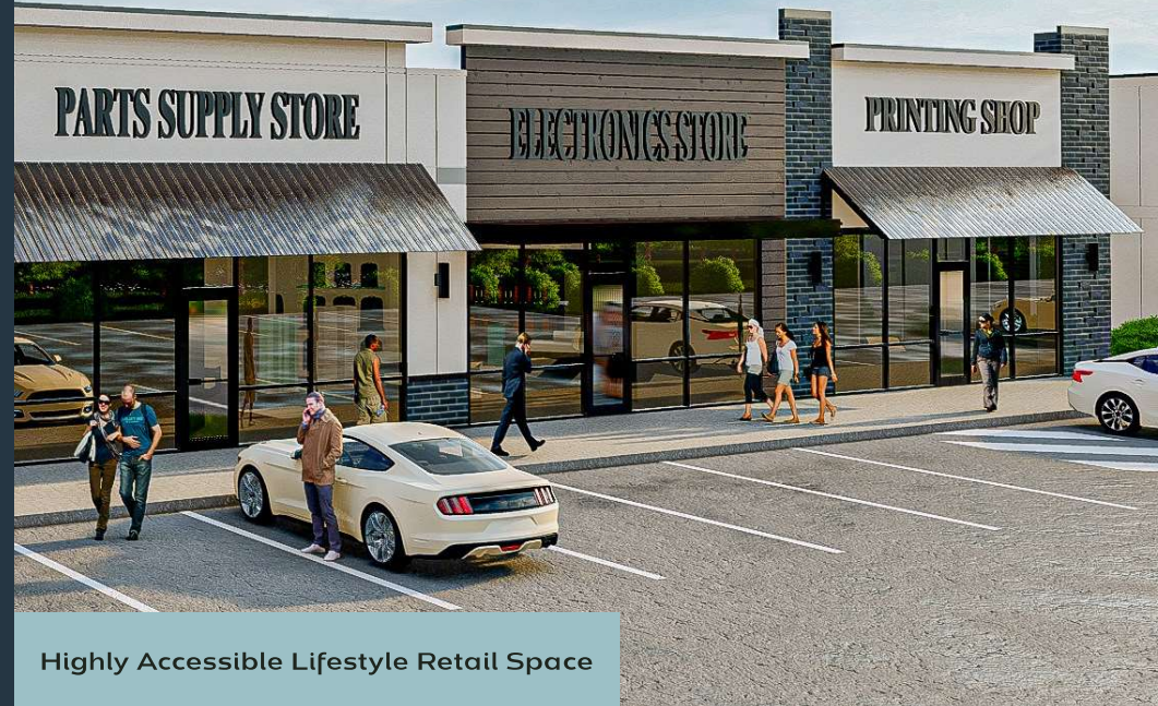
Highly Accessible Lifestyle Retail Space

YOUR NEXT MOVE TO A PRIME LOCATION WITH GREAT VISIBILITY & ACCESSIBILITY.