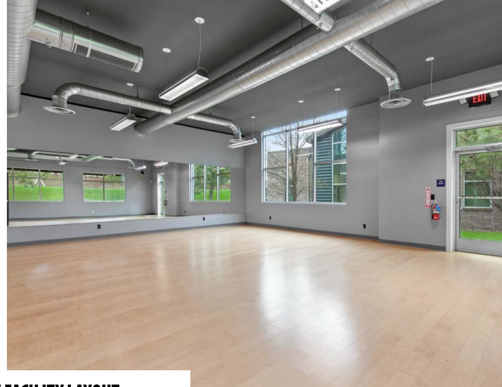
HIGH QUALITY, ATHLETIC FACILITY LAYOUT