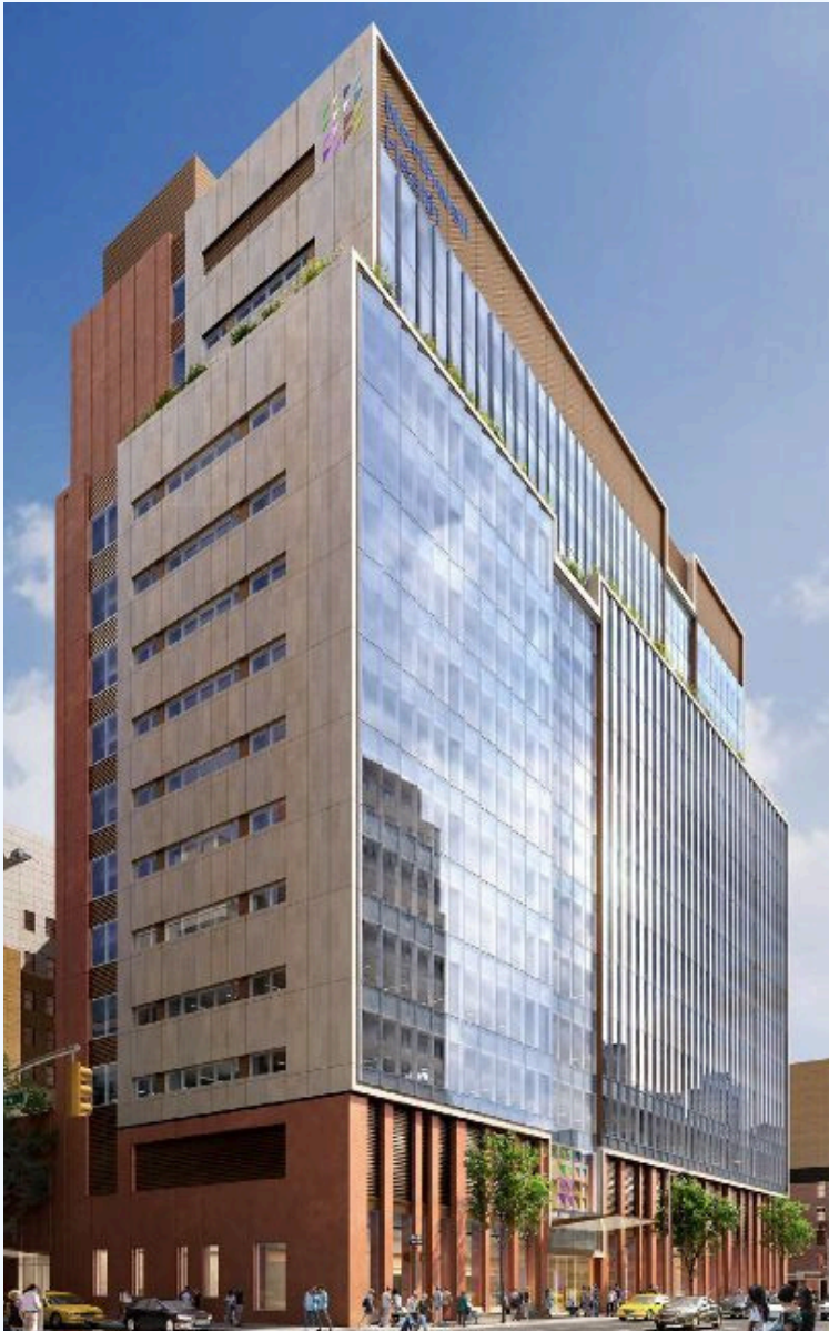
NORTHWELL VICTORIA AND LLOYD GOLDMAN HEALTH CARE PAVILION