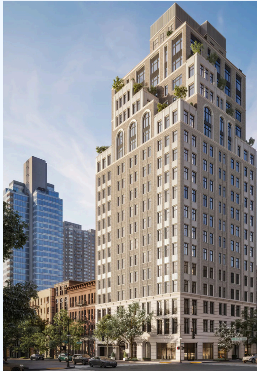
200 EAST 75 TH STREET BUILT BY EJS REAL ESTATE