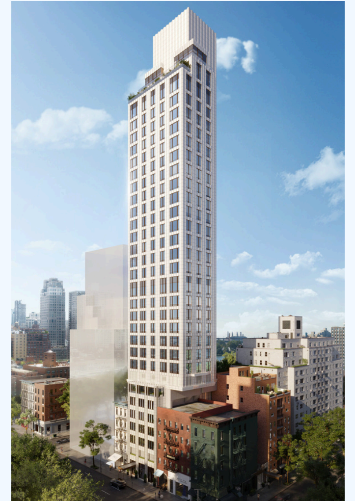
THE 74 BY ELAD GROUP