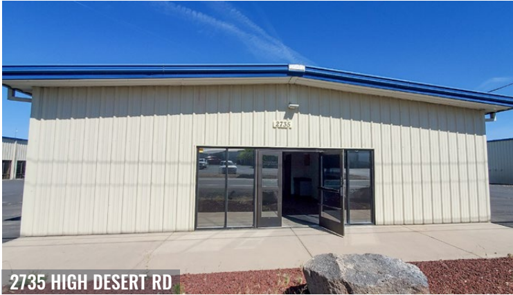
2735 HIGH DESERT RD