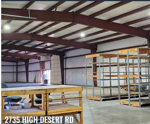
2735 HIGH DESERT RD

LOCATED WITHIN THE BALDWIN ROAD INDUSTRIAL PARK