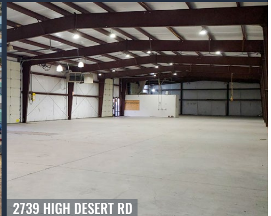
2739 HIGH DESERT RD