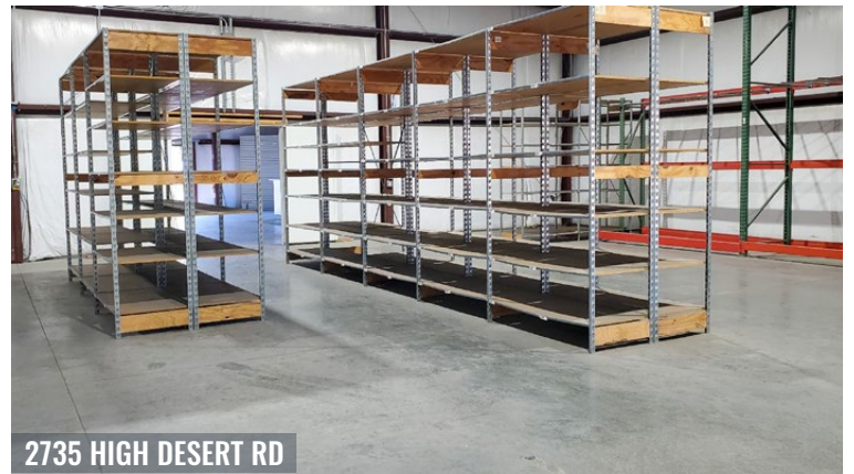
2735 HIGH DESERT RD