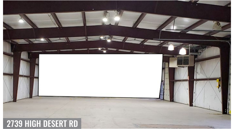
2739 HIGH DESERT RD