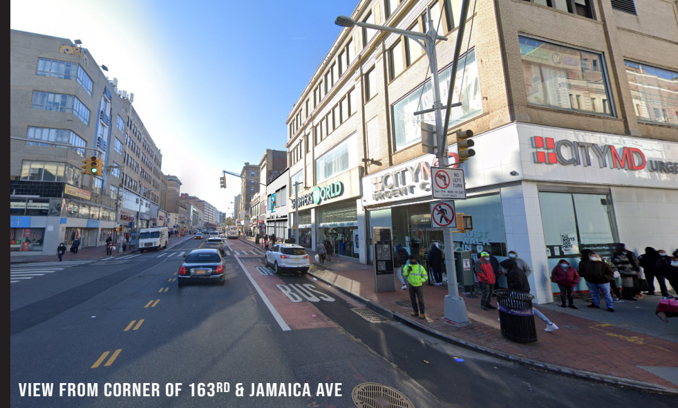
VIEW FROM CORNER OF 163RD & JAMAICA AVE