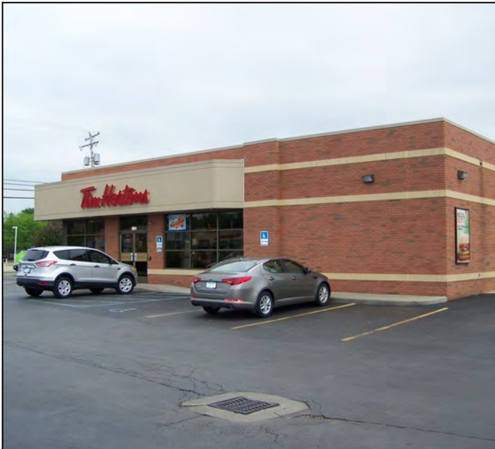
Tim Hortons Next Door To The East