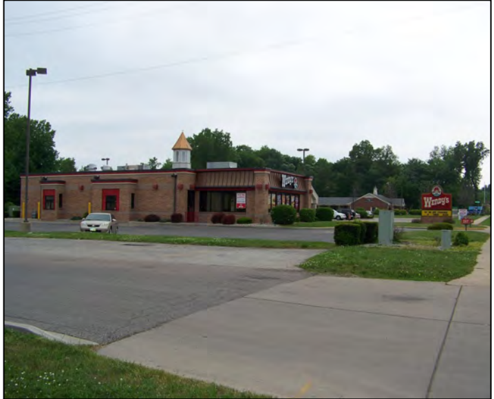
Wendy's Next Door To The West