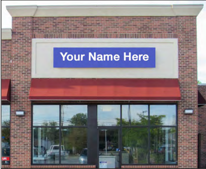
Available West End Cap