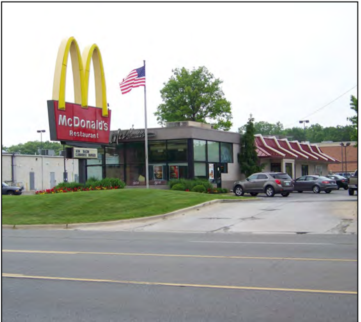
McDonalds Across The Street To The North