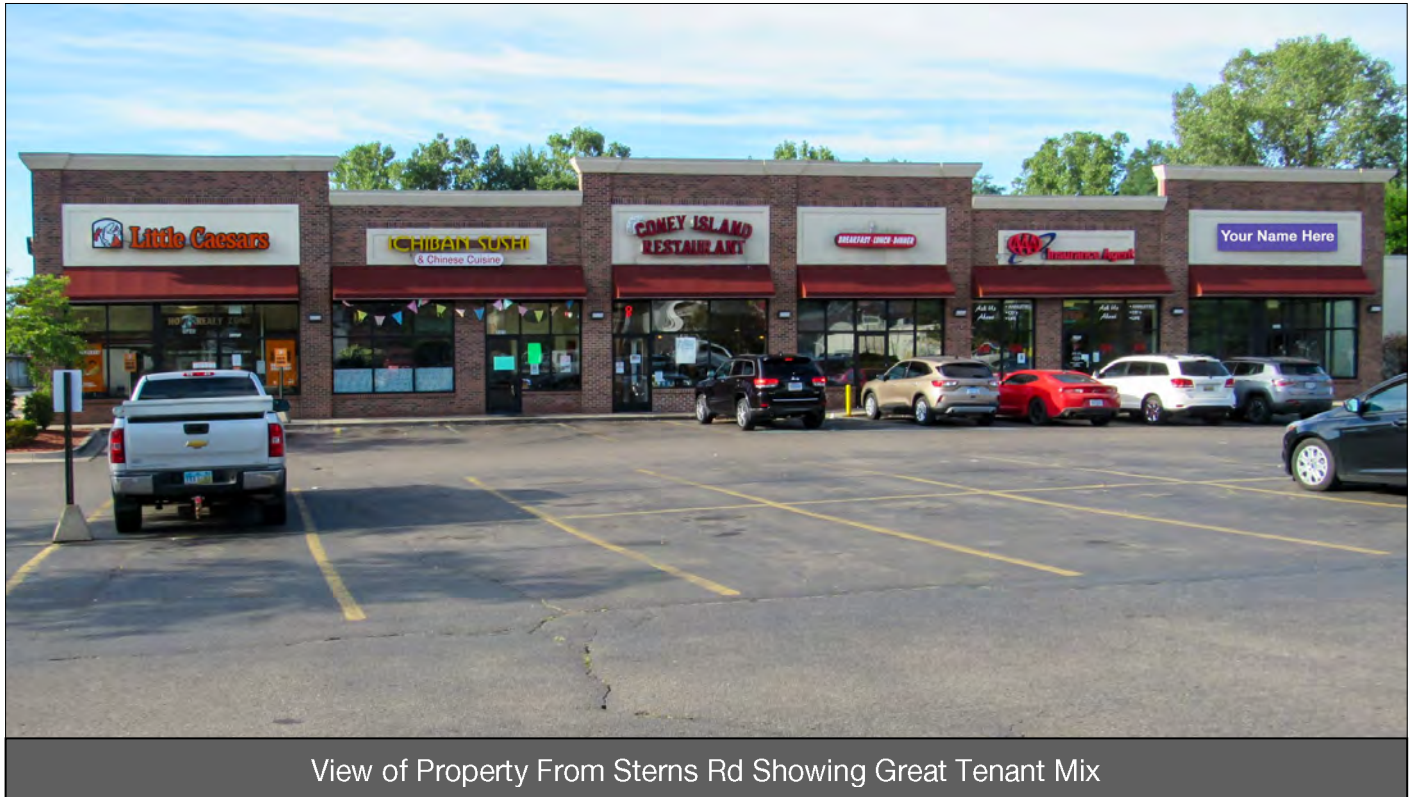
View of Property From Sterns Rd Showing Great Tenant Mix

NAIHarmon Group | 4427 Talmadge Rd Suite A, Toledo, OH 43623 | (419) 960-4410 | naiharmon.com