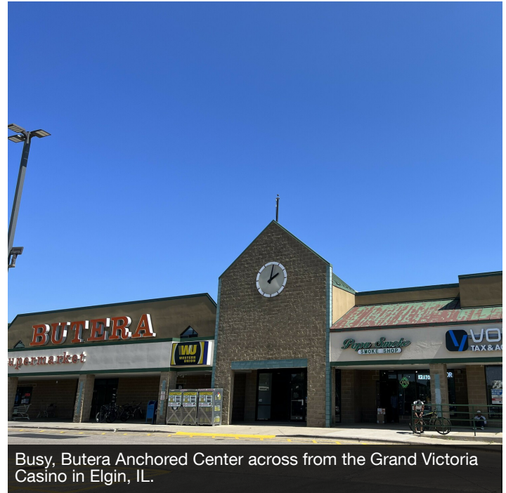
Clock Tower Plaza - Elgin, IL