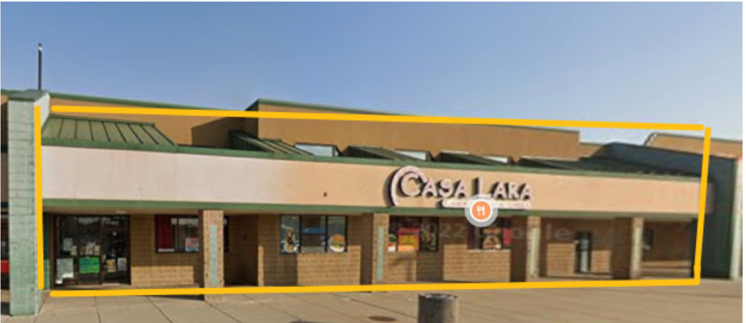
Space #7 - 6,500 SF - Divisible - Former Casa Lara Restaurant