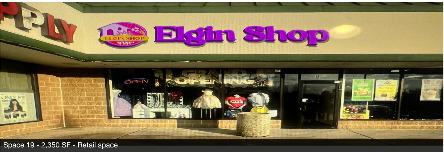
Space 19 - 2,350 SF - Retail space

Sandra True Commercial Broker (630) 248-7518