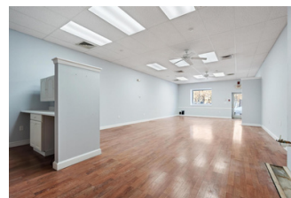
225 Groton Road, Unit 2, Westford, MA