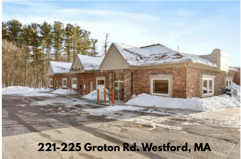
221-225 Groton Rd. Westford, MA