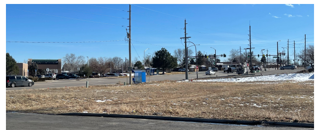
Street View Looking onto Huron St (easement location)

PJ Magin - Broker (303) 921-7944 pjmagin@comcast.net EA100028175