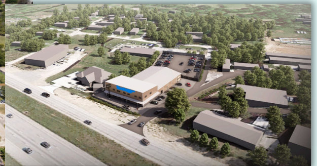
Future Additional Parking Plan