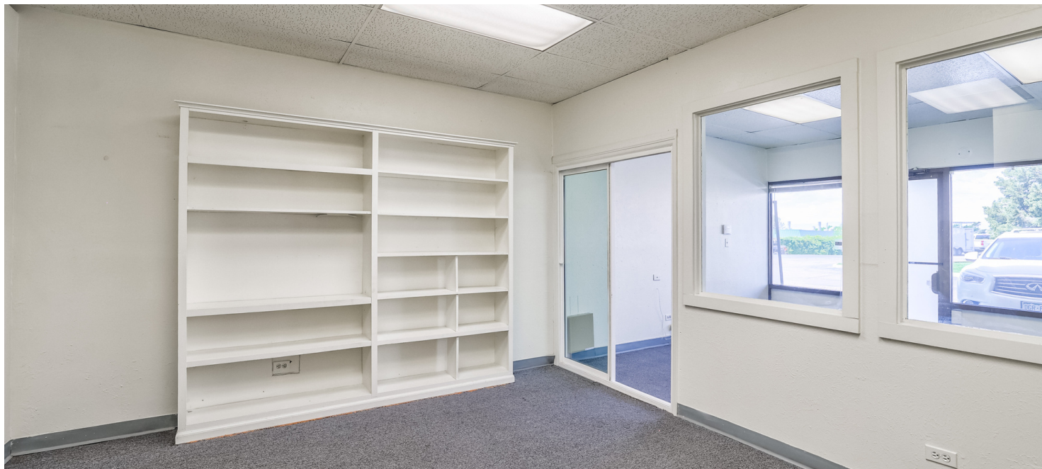
# 502 Front View to front from private office