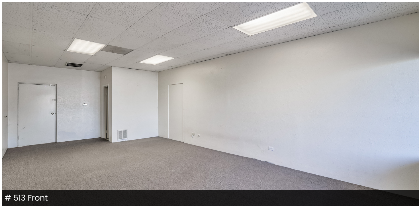
# 513 Front