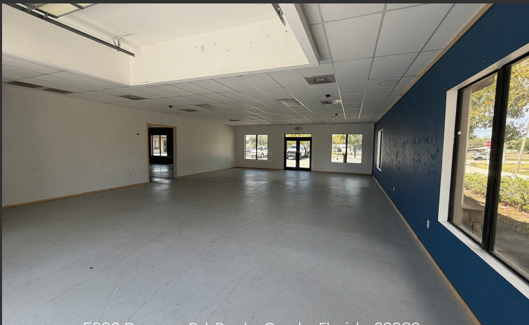
5260 Duncan Rd, Punta Gorda, Florida 33982

With storefront glass, generous parking, and flexible commercial zoning, the property is well suited for contractors, service businesses, trades, showroom users, storage, fitness, distribution support, or other commercial users looking for adaptable space in a highly accessible location. Up to 6,104 sq ft and can be demised into (3) 1500 sq ft spaces and (1) 1604 sq ft space.