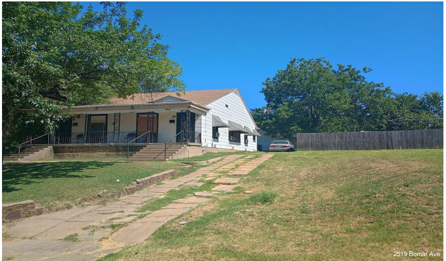
2519 Bomar Ave