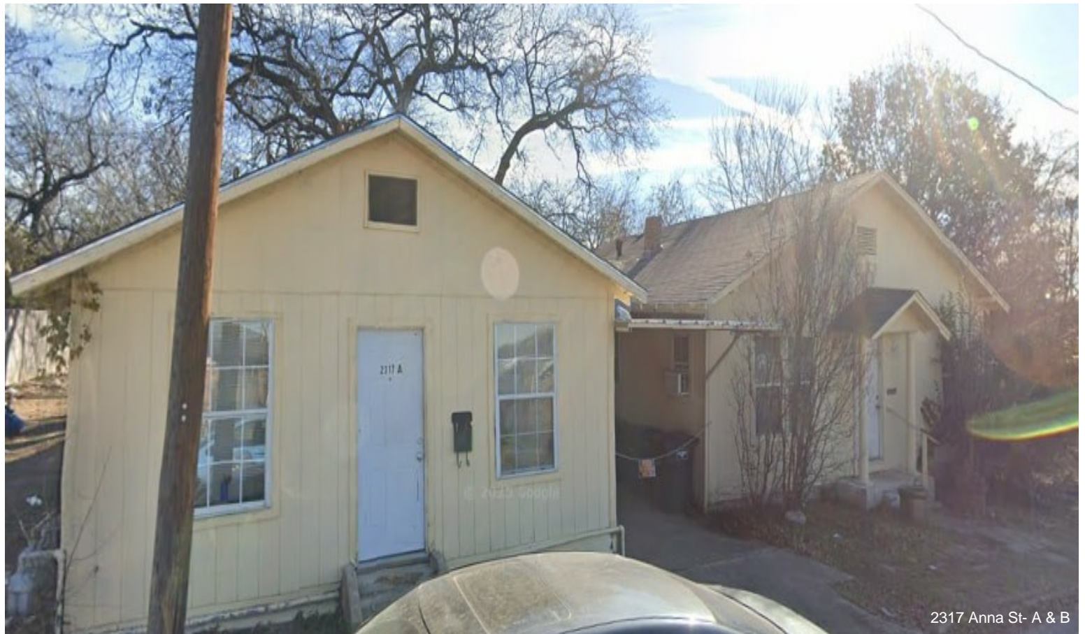
2317 Anna St- A & B