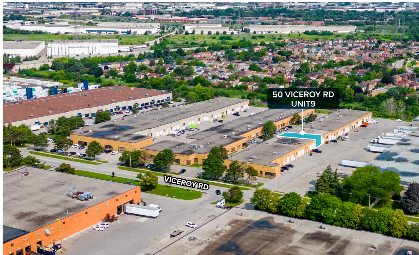
*Outlines are approximate