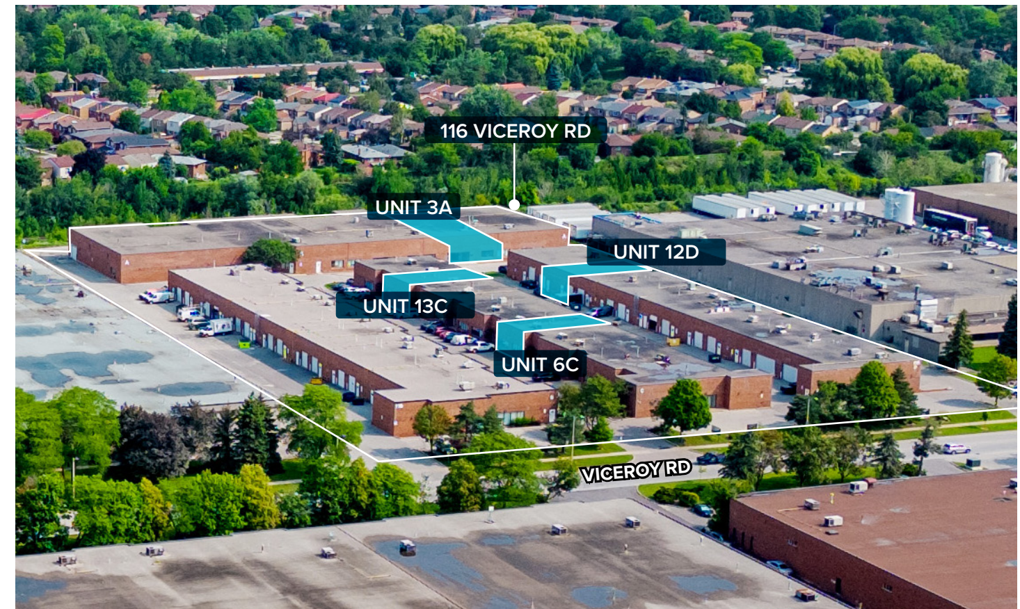
*Outlines are approximate