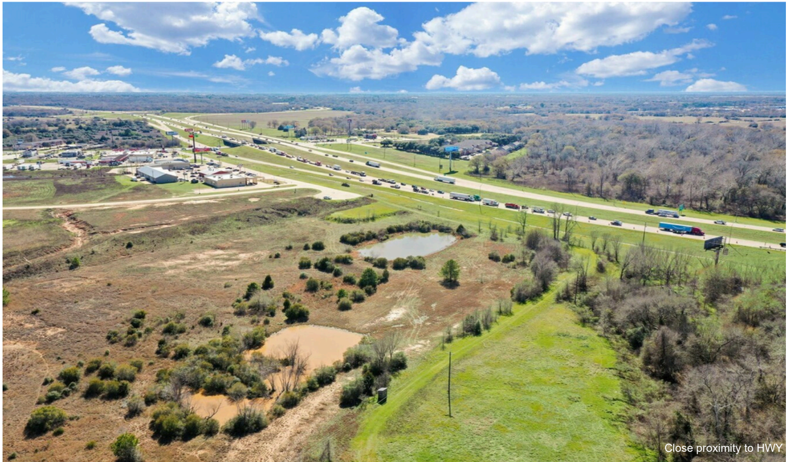
Close proximity to HWY