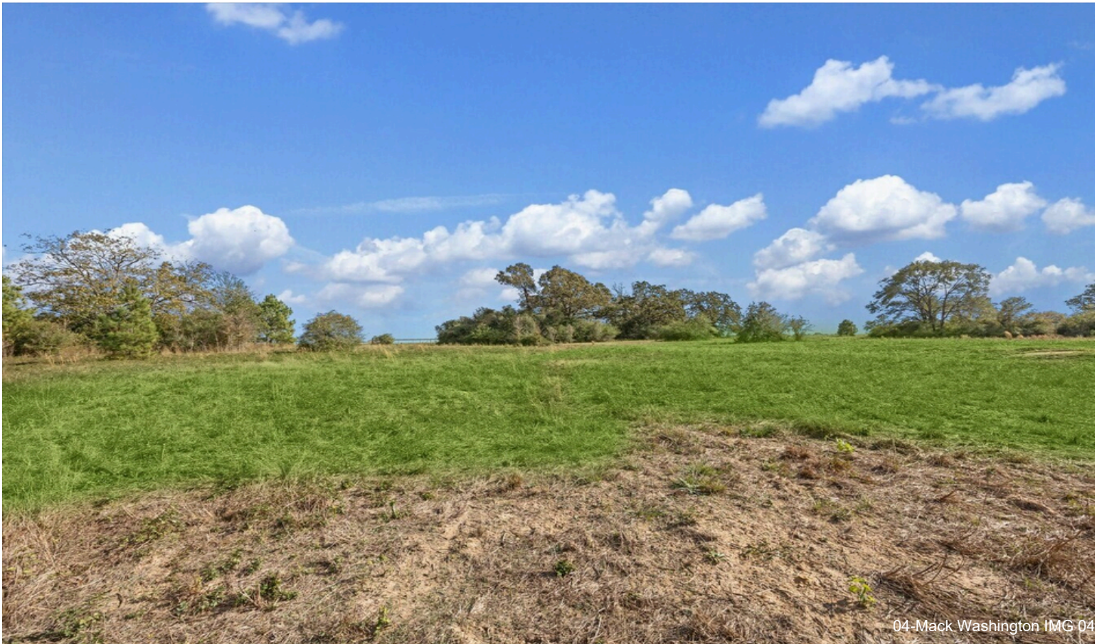
04-Mack Washington IMG 04