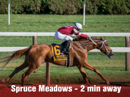
Spruce Meadows - 2 min away