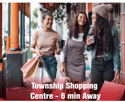
Township Shopping Centre - 6 min Away