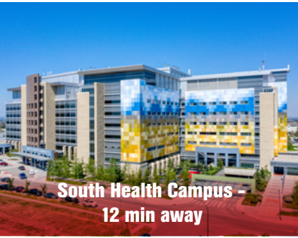
South Health Campus - 12 min away