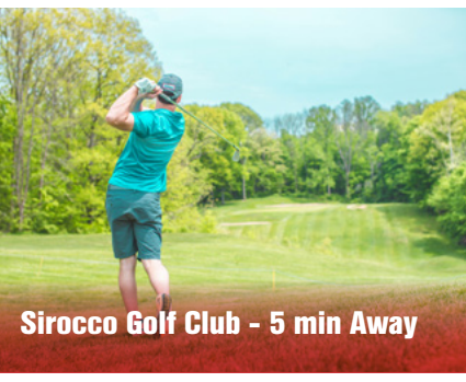
Sirocco Golf Club - 5 min Away