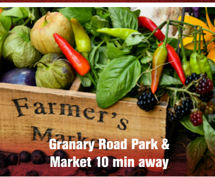
Granary Road Park & Market 10 min away