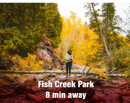
Fish Creek Park 8 min away