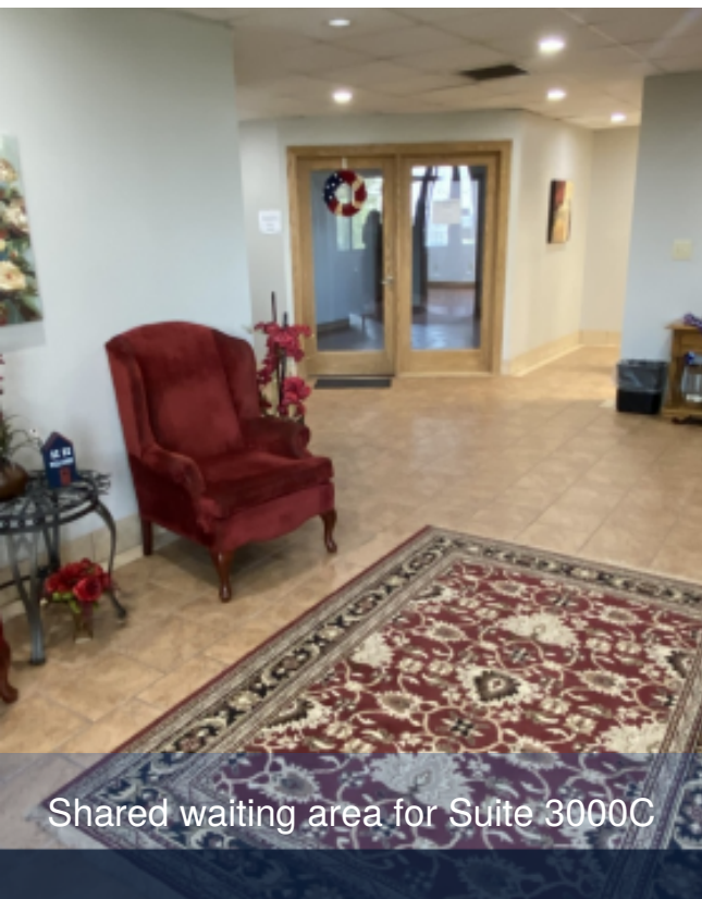
Shared waiting area for Suite 3000C