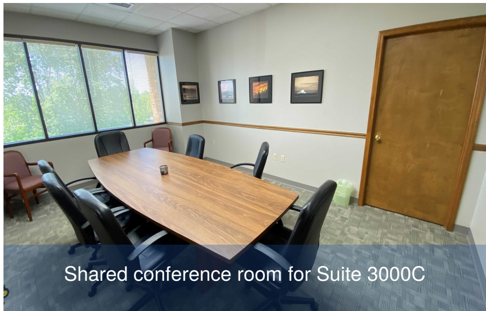
Shared conference room for Suite 3000C