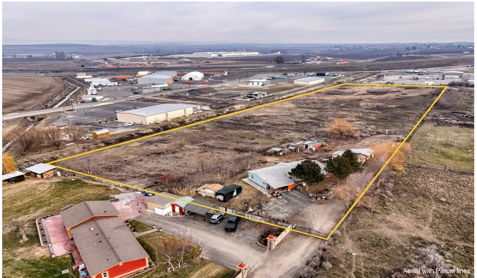
Aerial with Parcel lines