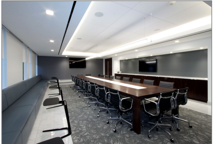
MULTIPLE CONFERENCE ROOMS / BOARDROOM FOR 25