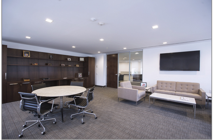
EXECUTIVE SUITE AREA