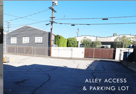
ALLEY ACCESS & PARKING LOT