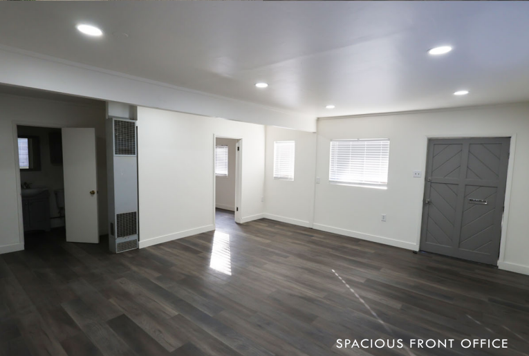
SPACIOUS FRONT OFFICE