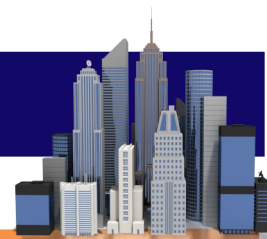
Aerial- Close Up

COMMERCIAL INVESTMENT PROPERTY -For Sale