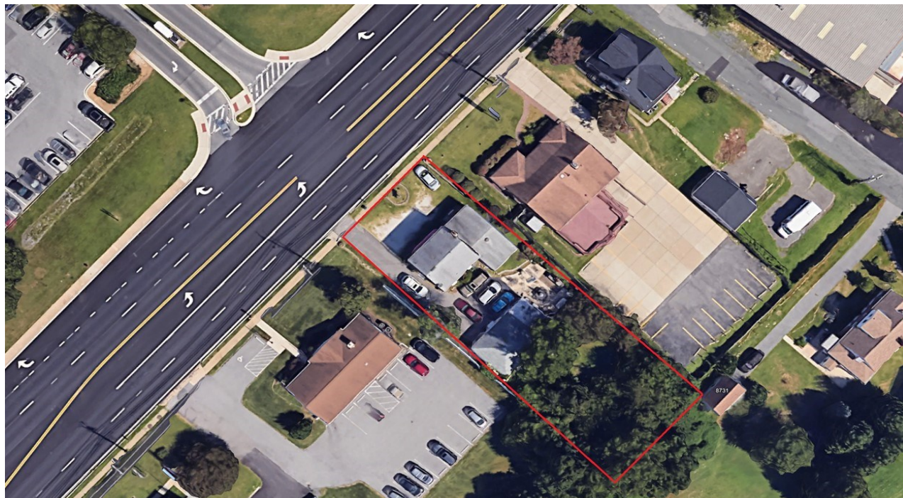
Aerial - Location Area