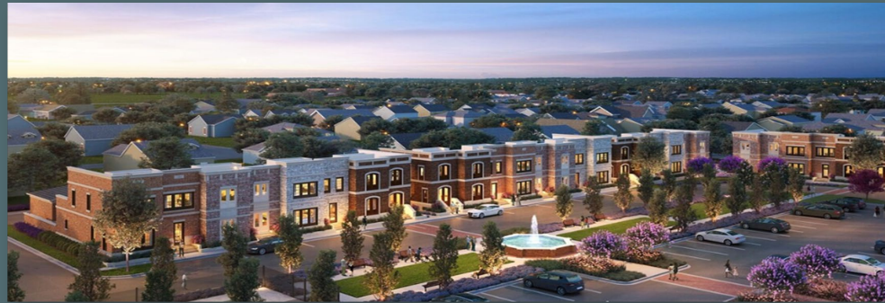
THE PROVOST APARTMENTS