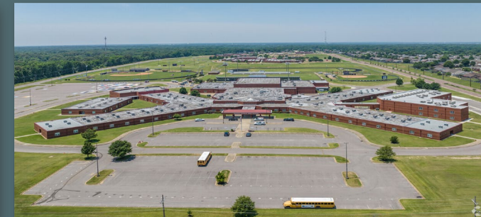
DESOTO CENTRAL HIGH SCHOOL