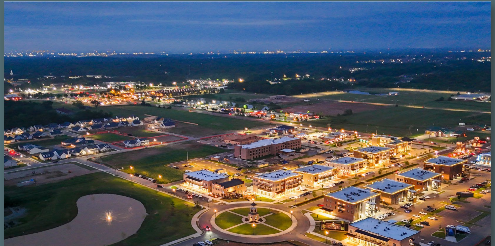
THE SILO SQUARE NIGHTLIFE