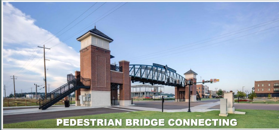
PEDESTRIAN BRIDGE CONNECTING SILO SQUARE TO SNOWDEN GROVE