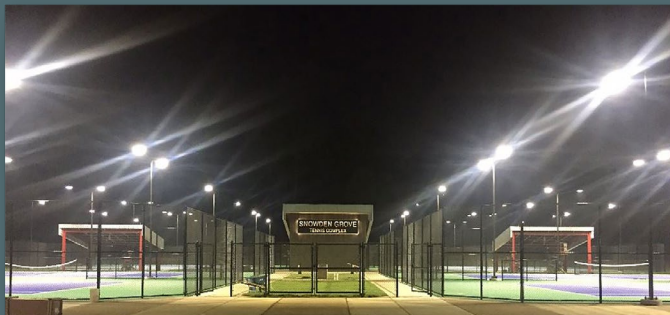
SNOWDEN GROVE TENNIS COMPLEX