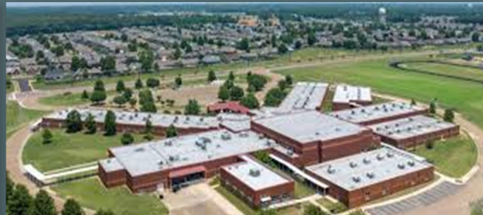
DESOTO CENTRAL MIDDLE SCHOOL