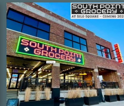
GROCERY STORE 2025