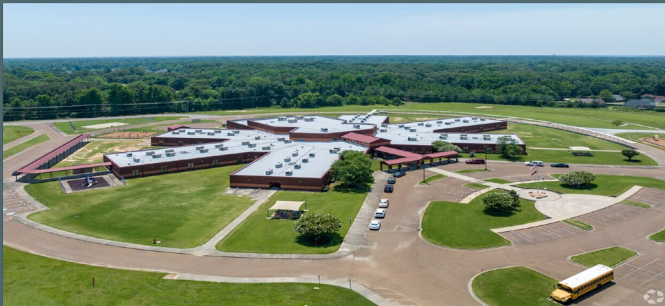
DESOTO CENTRAL ELEMENTARY SCHOOL