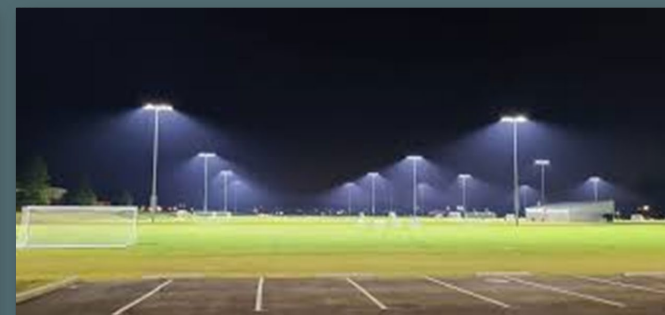
SNOWDEN GROVE SOCCOR COMPLEX