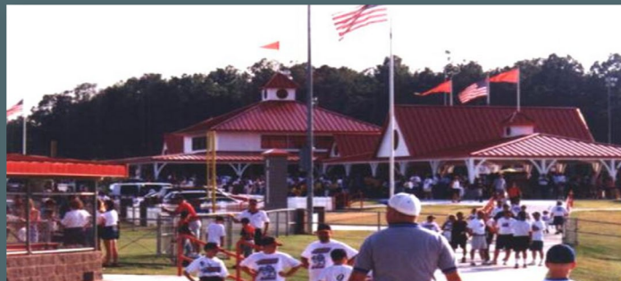
SNOWDEN GROVE BASEBALL COMPLEX