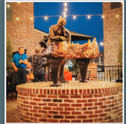
JERRY LEE LEWIS STATUE