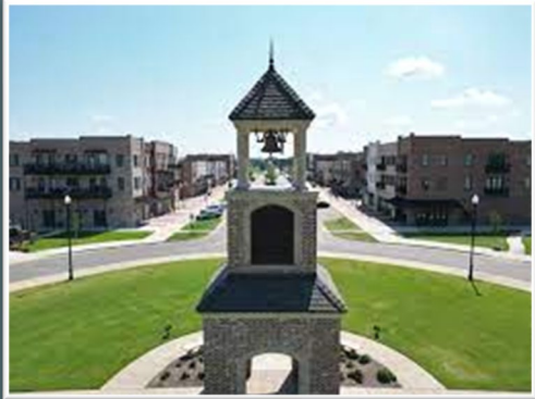
SILO BELL TOWER