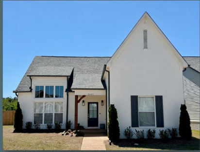
TOWN SQUARE COTTAGES