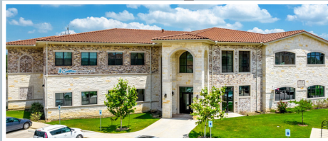
Villages on Sonterra Medical Office