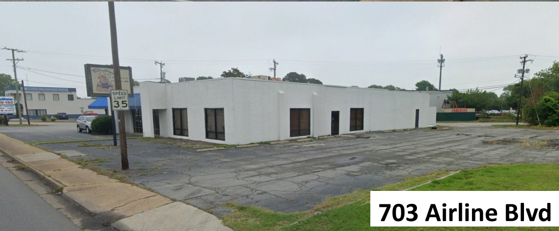
703 Airline Blvd

Below market rents with long term investment upside