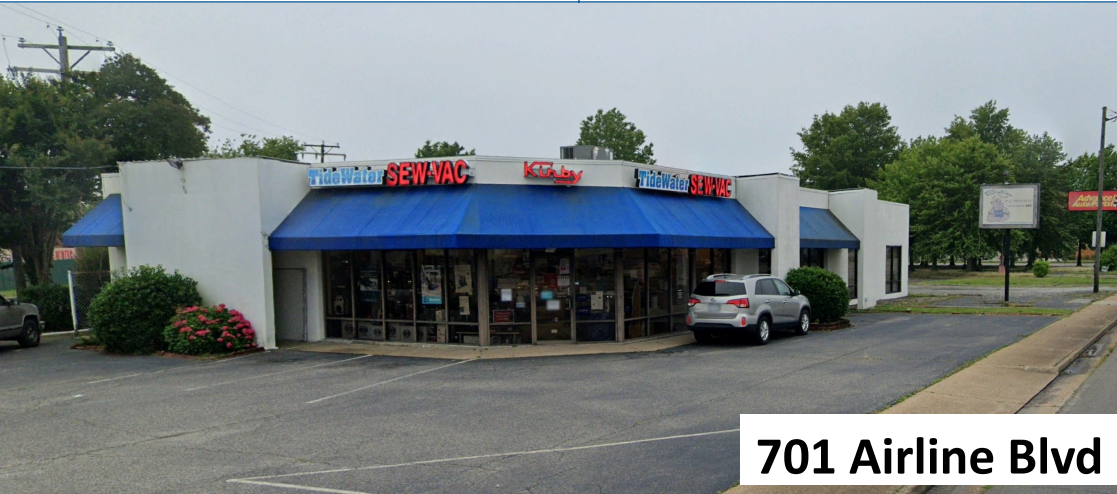
701 Airline Blvd

701 and 703 Airline Boulevard, Portsmouth VA 23707