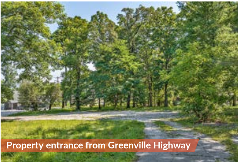
Property entrance from Greenville Highway