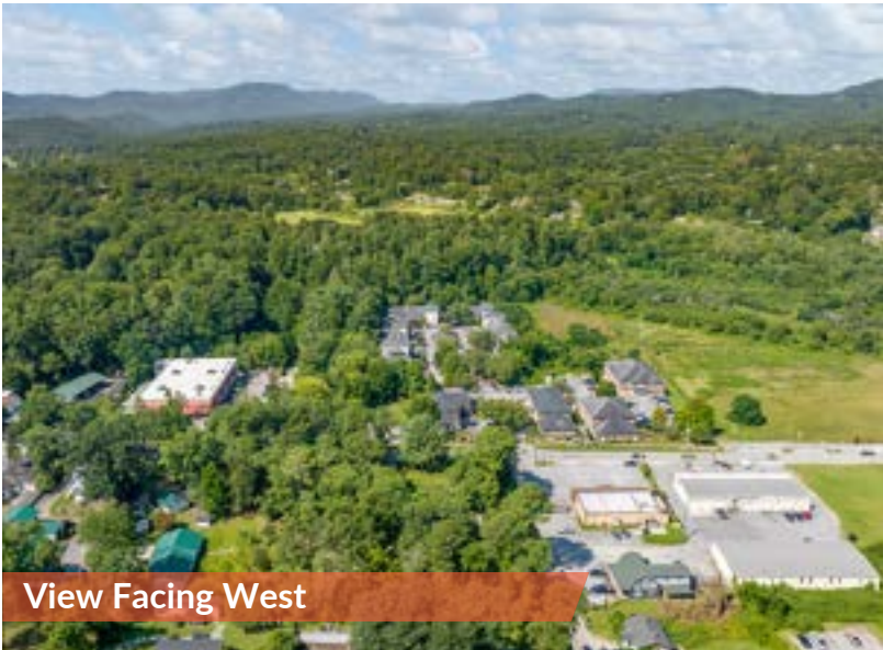
View Facing West