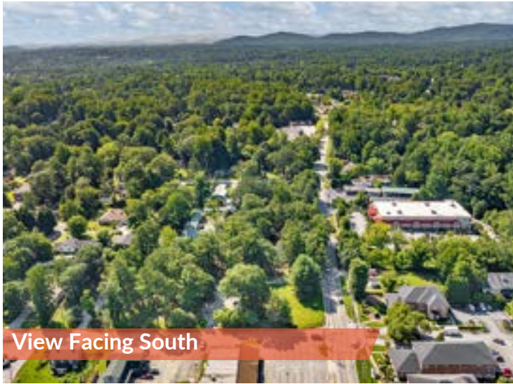
View Facing South