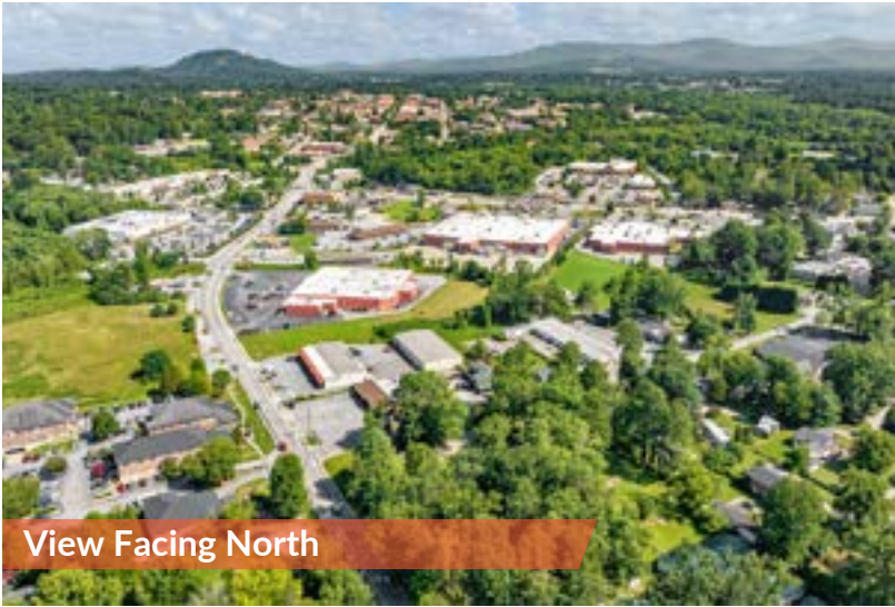
View Facing North