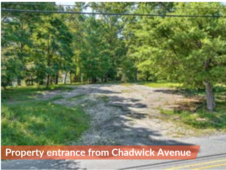
Property entrance from Chadwick Avenue