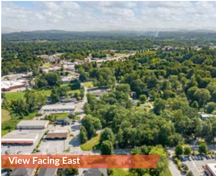
View Facing East