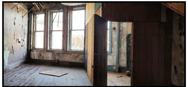
2nd Floor Cotton Avenue View