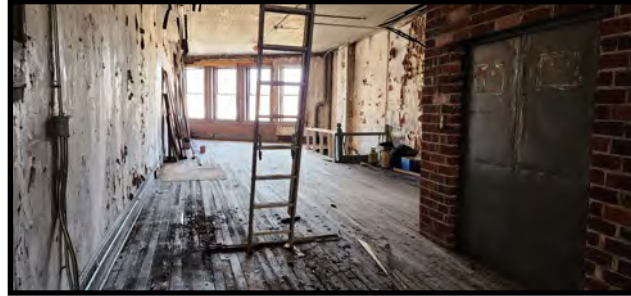
3rd Floor Cotton Ave View/Brick Elevator Shaft

STOREFRONT RETAIL / OFFICE 385 SECOND STREET - MACON, BIBB COUNTY, GA 31201