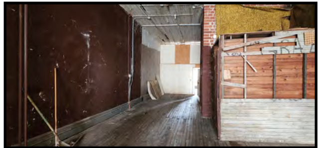
2nd Floor Cotton Ave View/Brick Elevator Shaft