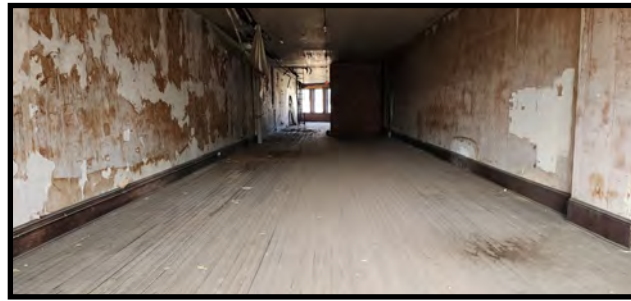
3rd Floor Second Street View