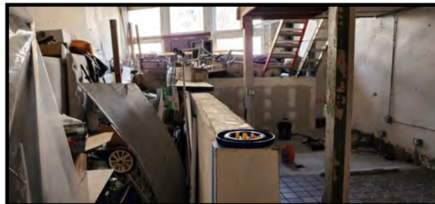
1st Floor Rear Exit Cotton Avenue