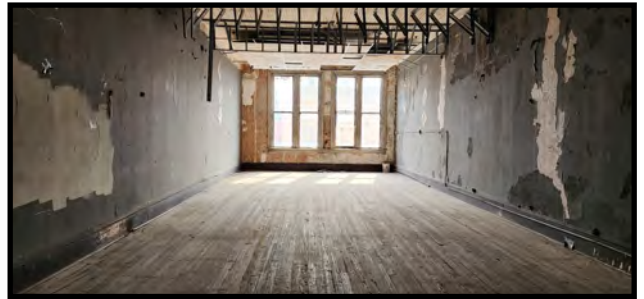
2nd Floor Second Street View