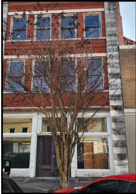
1st Floor Cotton Avenue Entrance

STOREFRONT RETAIL / OFFICE 385 SECOND STREET - MACON, BIBB COUNTY, GA 31201