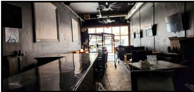
1st Floor Second Street Entrance