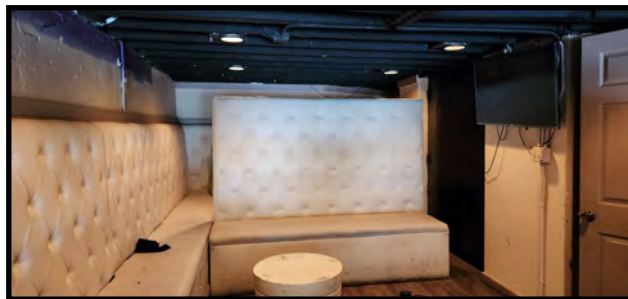
1st Floor Mezzanine